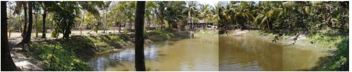
North view to proposed building location from the opposite side of the pond in the property.