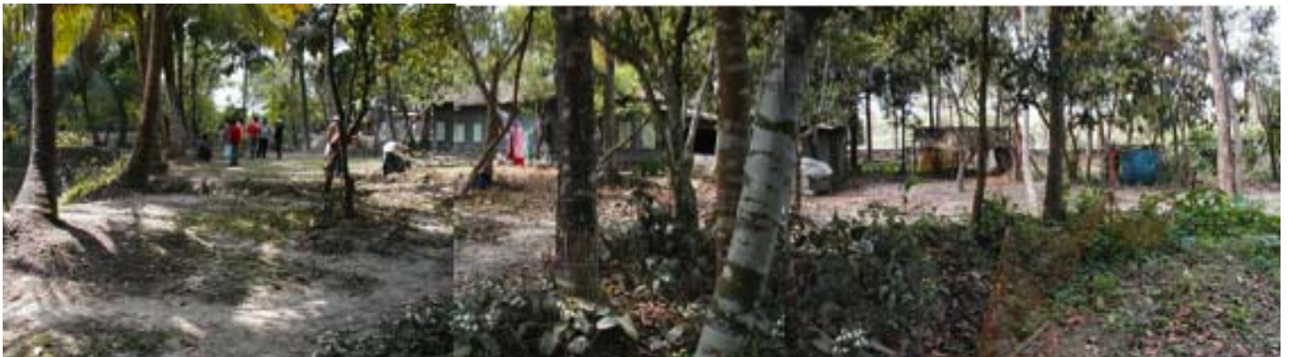
Looking at proposed building site at south-east corner