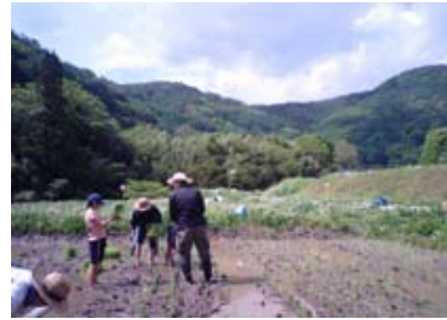
Rice planting with the community