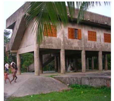
A typical existing cyclone shelter