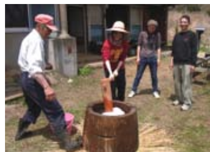
Making rice cakes at Leaders Camp last May