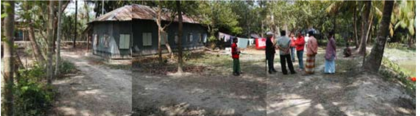
Looking at proposed building site at south-west corner