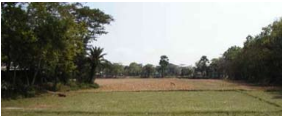
A view around project property