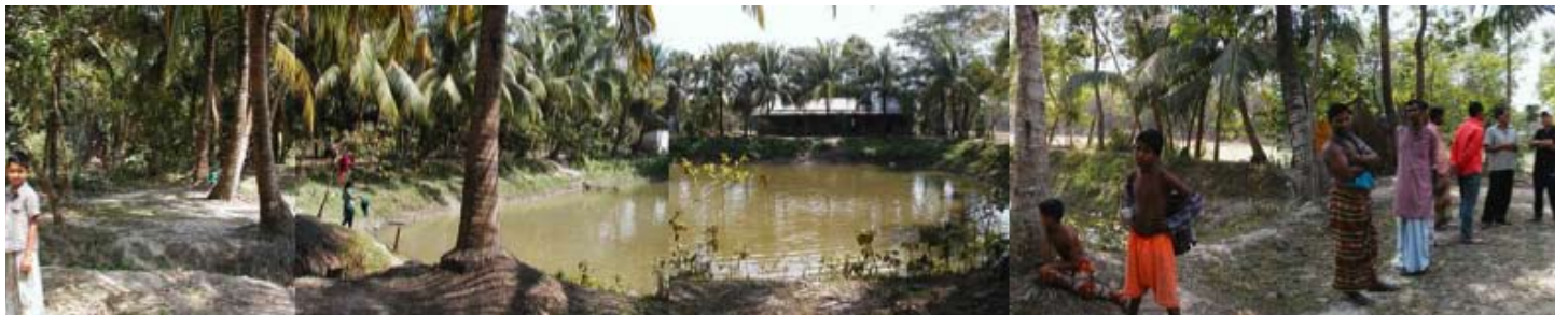
South view from proposed building location.

We all need the support and cooperation from all corners of SCI world to materialize this project which is initiated jointly by SCI Japan and Bangladesh. This project would be a permanent SCI Asian project where volunteers from all over the world can come and take initiative for the social good causes.