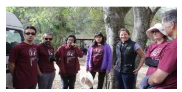
Volunteers arrive for the workcamp in Taralga in May 2016

Tree planting with Taralga Primary School