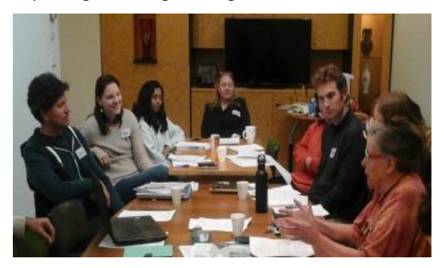
Annual General Meeting held in June 2016

The session began with the group briefly brainstorming where they would like to see IVP in the coming 6-12 month period. The responses identified a number of areas of focus including organising a number of workcamps, involving returned volunteers and developing projects in partnership with communities in Australia (Aboriginal communities and refugee groups in particular). There were also discussions about building the capacity and functionality of the committee, recruiting more local volunteers and improving knowledge management.